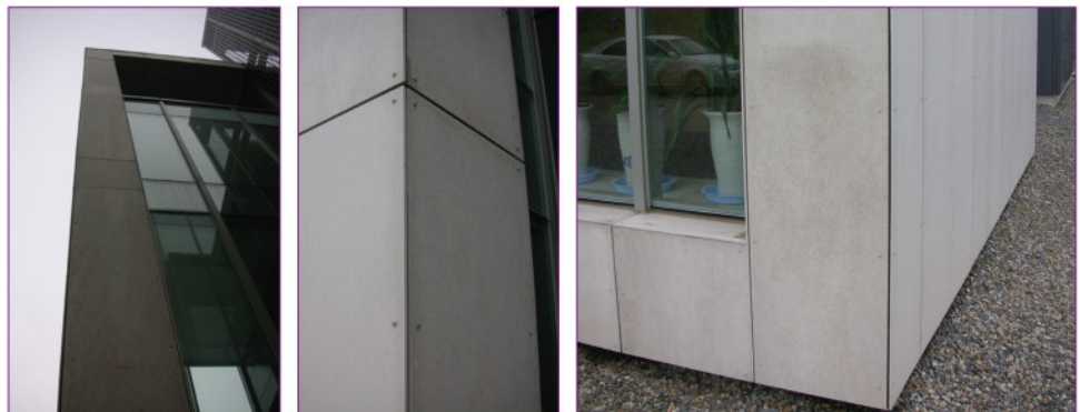
Undecorated building façade