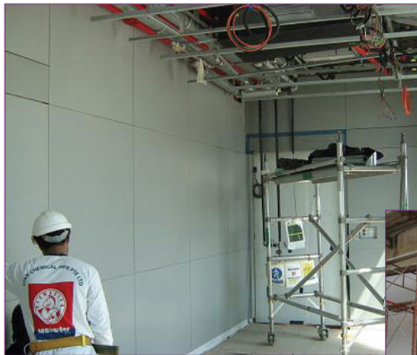
Lining board for over-cladding system