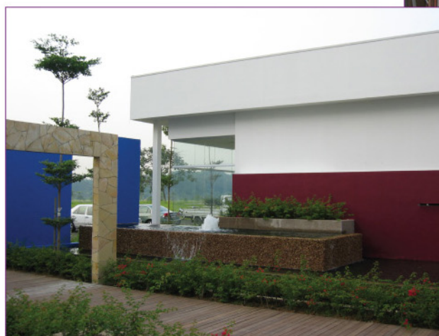
External Wall lining